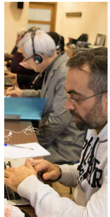
CIOFS Presidency members gathered in Rome from March 18 to 25, meeting from morning to night on the business and spirit of the worldwide Secular Franciscan Order.