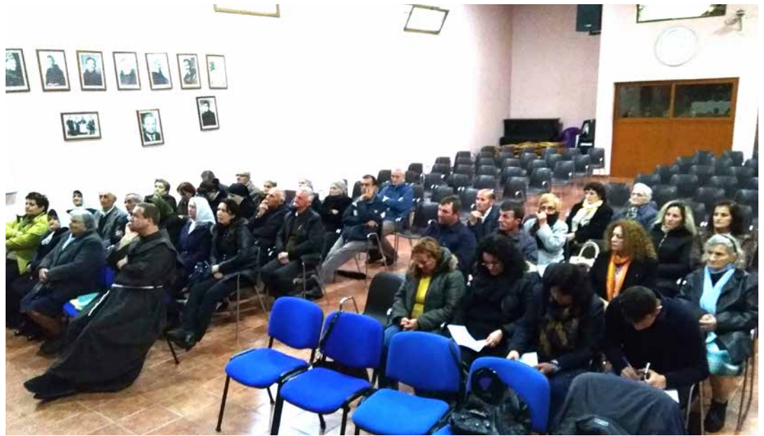
Delegates and observers attend the Albania chapter.