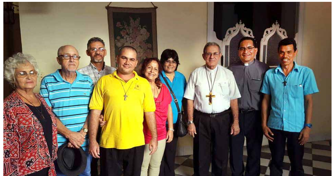
Secular Franciscans and visitors meet with the Havana archbishop.

The visitors were hosted by the Capuchin Friars at the convent-church of “Cristo de Limpias” in the old Havana quarter. Most of the meetings were held at the Church of Saint Francis in the historical center of the city, managed by the OFM Conv. Friars. The visitors held