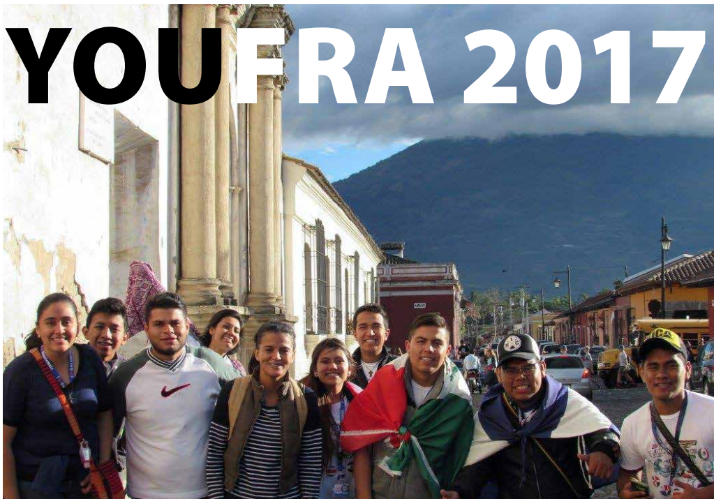
ABOVE AND BELOW: Some of the YouFra participants at the gathering in Guatemala.